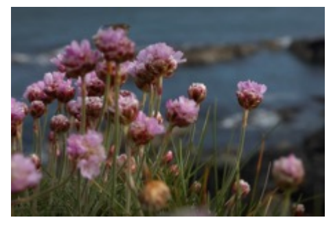
Flowering Thrift

Our opinion counts, so we feel more included and more in charge. We can make our own decisions about how to achieve things instead of being told what to do. Glastir was very prescriptive with just a list of dates when we could or couldn't do things, and a list of actions we had to do to get paid. It was very heavy on paperwork and there was no one to ask or get advice from. With this scheme there is much more flexibility with the changing seasons and available advice. There's also incentive to make the changes because the better a habitat becomes, the bigger the payment. There's also more collaboration, and we have a better tenant/landlord relationship instead of just getting a bill twice a year or being in touch when something goes wrong. This scheme is about rewarding good practice that benefits the wider environment and those who live in it, as well as helping to address the climate and biodiversity crisis. So, for example, grazing the coastal slopes at certain times of year also benefits those who use the Wales coastal path, and increases diversity on the slopes. Historically this strip was just left so rank grasses and bracken took over.