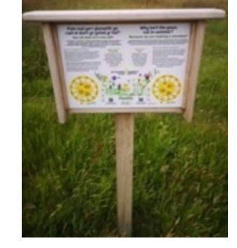
Greater butterfly orchid in Mynytho community meadow, and the interpretation board funded by Plantlife