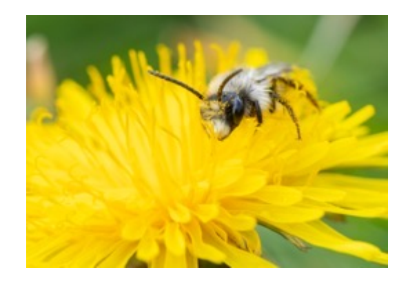
An Ashy Mining Bee in a hay meadow