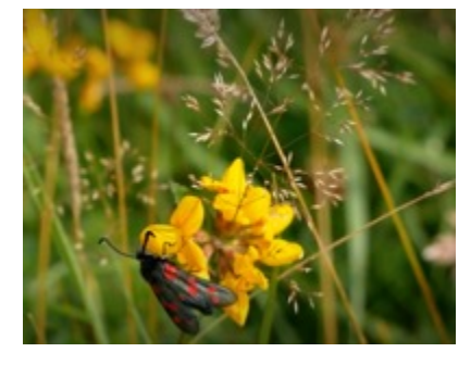
Six-spot burnet on bird's foot trefoil