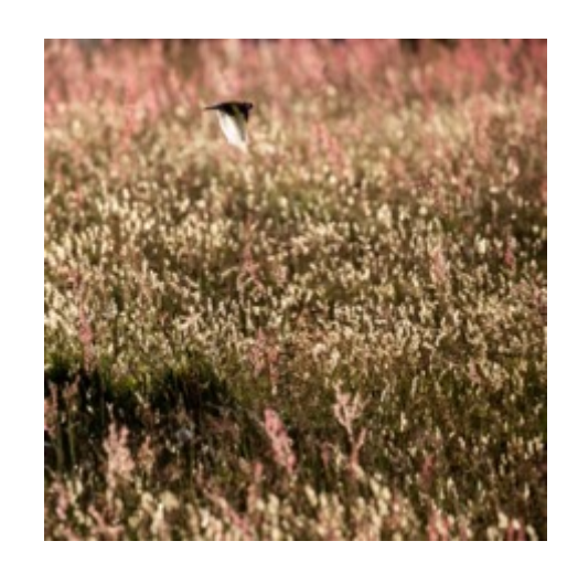
A Goldfinch in a meadow of Common sorrel