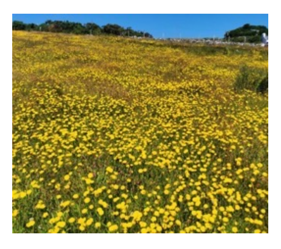
A Rhiw meadow full of Common catsear