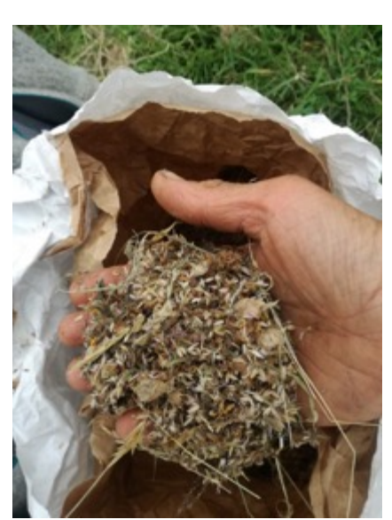
The brush harvester at work