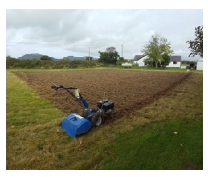
Camon C8 Rotavator

For more information on making mini meadows visit the Plantlife meadow hub: <a href="https://meadows.plantlife.org.uk/making-meadows/">https://meadows.plantlife.org.uk/making-meadows/</a>