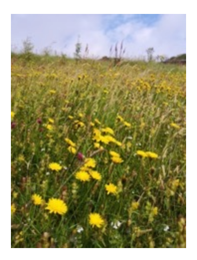
A species rich meadow