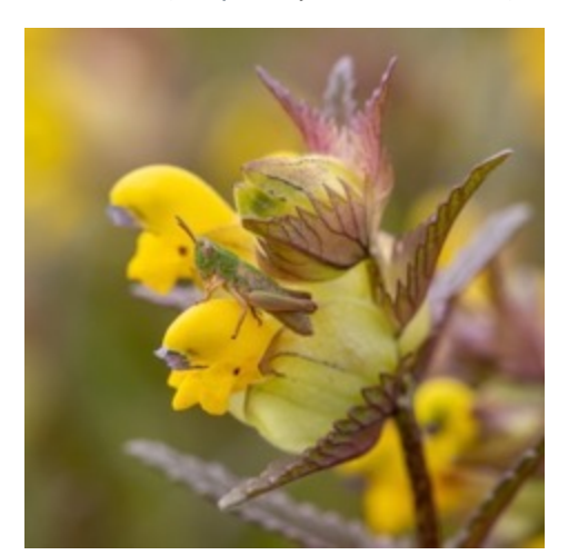
Meadow grasshopper on Yellow rattle