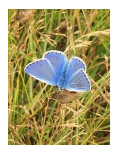
Common blue butterfly